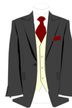
Personal Presence Day